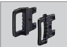
MB-116 HANDLES Protect buttons and knobs on the front panel when moving the radio.