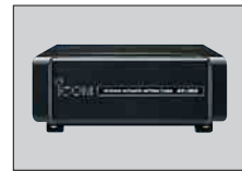
AT-180 AUTOMATIC ANTENNA TUNER Compact, light weight antenna tuner.