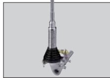
AH-2b ANTENNA ELEMENT For mobile operation with the AH-4. All bands between 7–30 MHz can be matched.