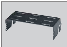
MB-118 MOBILE MOUNTING BRACKET For mounting the radio in a vehicle.