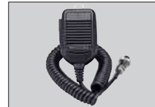
HM-36 HAND MICROPHONE Same as that supplied with the radio.