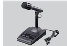
SM-20 DESKTOP MICROPHONE High quality desktop microphone. Includes [UP]/[DOWN] switches and low cut function.