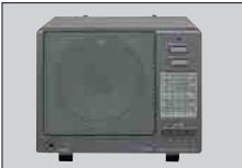
SP-20 EXTERNAL SPEAKER 4 audio filters; headphone jack; can connect to 2 transceivers. Input impedance: 8Ω. Max. input power: 5W