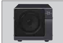
SP-21 EXTERNAL SPEAKER Input impedance: 8Ω. Max. input power: 5W