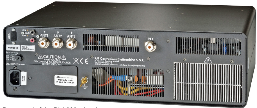
Rear panel of the BLA600, showing available connections. See text for details.

The SWR bar graph display doesn't seem to indicate the same SWR level at different power outputs, so it may be more of a reflected power indicator. The amplifier will go into fault mode if the SWR reaches about